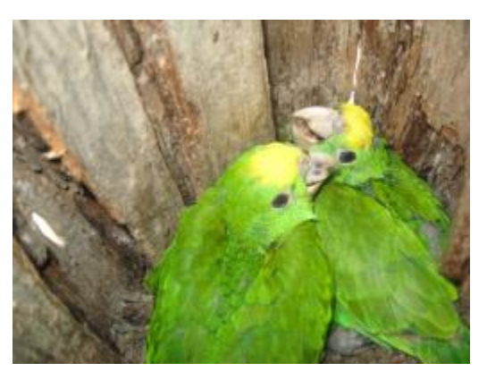
Yellowhead Parrot nest monitoring in PCNP

1.5 Establish biodiversity and wildfire baselines against which effects of fire control and sustainable harvesting will be monitored (TIDE, FD)