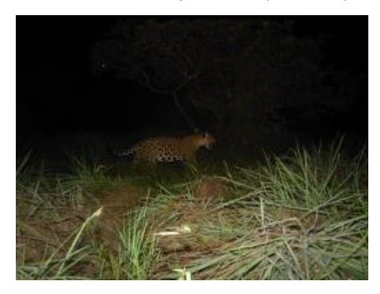
Camera Trapping focusing on jaguars

Protocol for monitoring of Birds is complete with monthly monitoring underway. Protocols for monitoring Large Mammals are being tested (camera traps) with ERI and PANTHERA and the protocol will be completed during the last quarter of year one (Jan-Mar). Protocol for monitoring of Yellow headed parrots is complete with assistance from the Yellow Head Parrot Working Group and baseline sampling to determine population status is planned for the last quarter of year one (Jan-Mar).